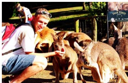
Plenty of kangaroos and koalas!

Today, you will visit Currumbin Wildlife Sanctuary where you can see Australia's native animals face to face in their natural surroundings.