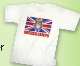
FREE British Soccer T-Shirt