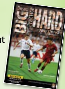
FREE GIANT, Fold Out Poster

All this! Plus the most innovative camp curriculum in the USA and a magical camp experience from qualified British coaches who really know how to make learning fun!