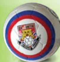
FREE Soccer Ball