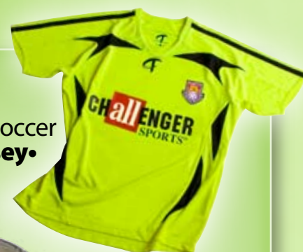
Official British Soccer Jersey

Watch the Barclays Premier League live on Setanta Sports Television